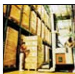
Logistic - Pallet Labelling