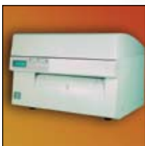
Fast print speed of up to 125mm/sec