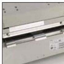
Automatic label loading via label edge sensor