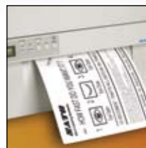
High quality printing at up to 305dpi