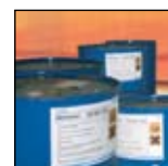
Chemical - Drum Labels

SATO makes no guarantee that the above features are available in all models, and specifications are liable to change, without notice. Version 09/06.