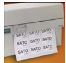
Extra-wide (267 mm) printing area for printing giant labels or multiple labels per page.