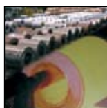
Steel Mill Industry