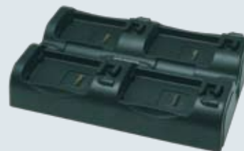
Multiple Battery Charger