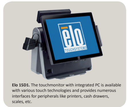
Elo 15D1. The touchmonitor with integrated PC is available with various touch technologies and provides numerous interfaces for peripherals like printers, cash drawers, scales, etc.