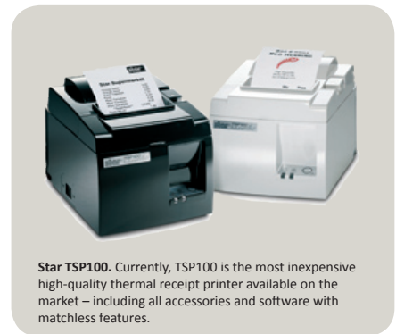
Star TSP100. Currently, TSP100 is the most inexpensive high-quality thermal receipt printer available on the market – including all accessories and software with matchless features.