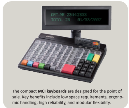
The compact MCI keyboards are designed for the point of sale. Key benefits include low space requirements, ergonomic handling, high reliability, and modular flexibility.