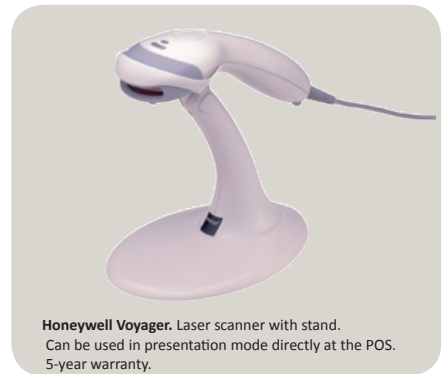
Honeywell Voyager. Laser scanner with stand. Can be used in presentation mode directly at the POS. 5-year warranty.