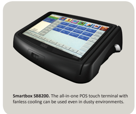
Smartbox SB8200. The all-in-one POS touch terminal with fanless cooling can be used even in dusty environments.