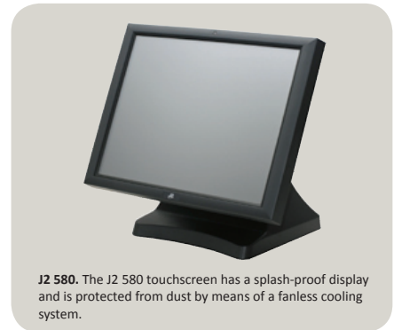
J2 580. The J2 580 touchscreen has a splash-proof display and is protected from dust by means of a fanless cooling system.