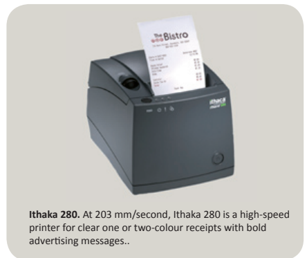
Ithaca 280. At 203 mm/second, Ithaca 280 is a high-speed printer for clear one or two-colour receipts with bold advertising messages..