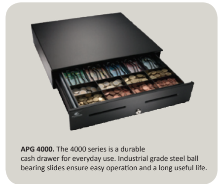
APG 4000. The 4000 series is a durable cash drawer for everyday use. Industrial grade steel ball bearing slides ensure easy operation and a long useful life.